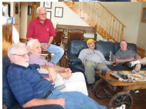
Who were those people???